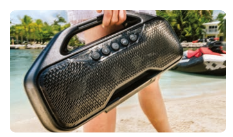
Upgraded BRP Audio - Portable System (optional)

Two fuel-efficient, compact and lightweight Rotax engine options.