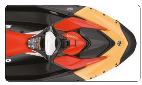
LinQ Lite Integration

Better cushioning to improve long distance comfort.