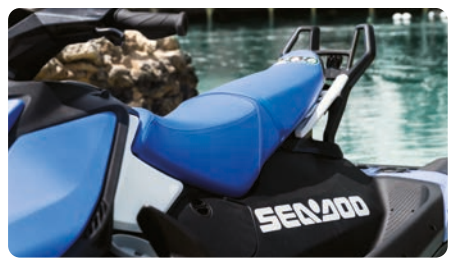
Improved Slim Seat

The newest Spark generation design has an improved appearance, revamped comfort and convenience with upgraded technology. The Innovative Polytec™ material further reduces weight while optimizing performance and efficiency. The color-in molding is more scratch-resistant than fiberglass.