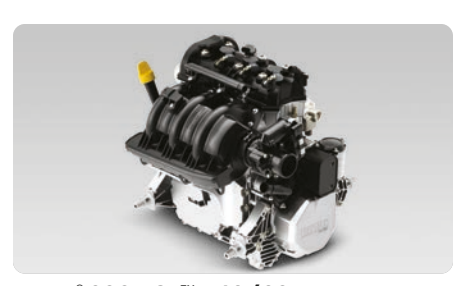
Rotax® 900 ACE™ - 60/90 Engines

Quickly accessible and located at 5 points of the unit (+2 on convenience package). Array of Sea-Doo LinQ Lite accessory range.