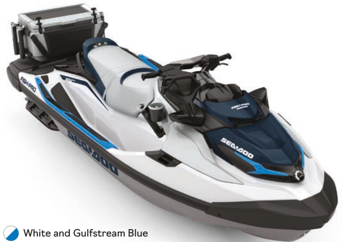
White and Gulfstream Blue